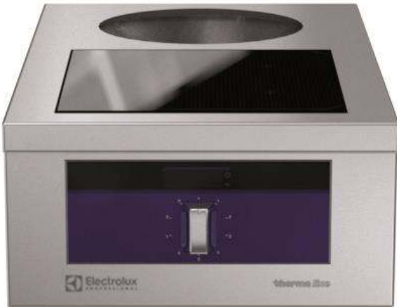
589042 (MCIKACEOAO) Induction Plate and wok, 2 zones, two-side operated